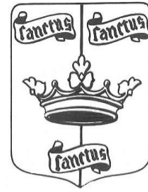
Arms of All Saints